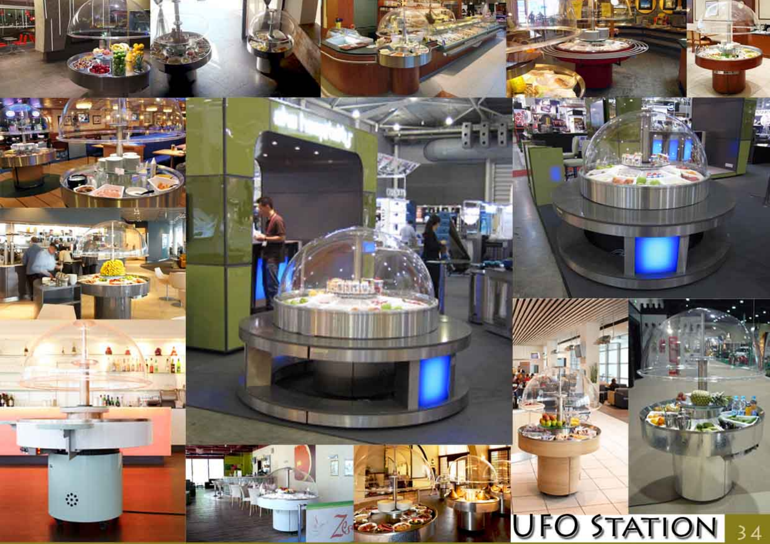
UFO STATION MODEL NO. : CS01-600A